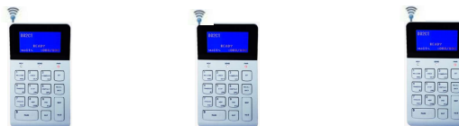
CLAVIER SANS FIL