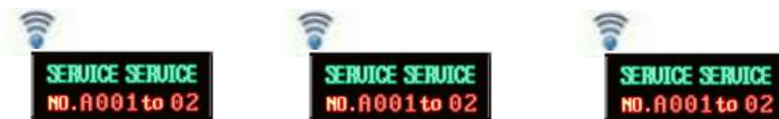
MINI AFFICHAGE LED COMPTEUR SANS FIL